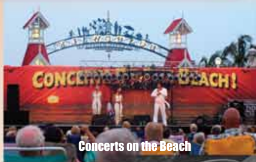
Concerts on the Beach

N. Division Street, OC. Live performances on the beach including tribute bands and local favorites. Bring your own blanket or chair. Free. 8pm. 800-626-2326. www.ococean.com