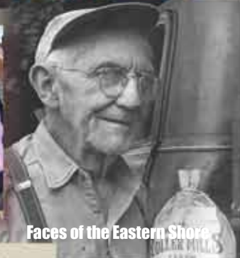
Faces of the Eastern Shore