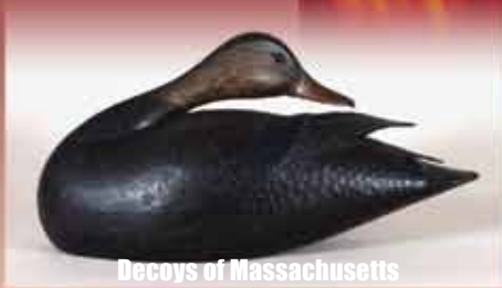
Decoys of Massachusetts

Ward Museum, Salisbury. Massachusetts craftsmen created a wider variety of shorebird species and forms than any other region. This exhibition showcases many species and techniques. Reception, Friday, October 8, 4:30pm-6:30pm. 410-742-4988. www.wardmuseum.org