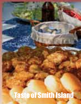
Taste of Smith Island

Marva Theater, Pocomoke. 7pm. 410-957-4230. www.mar-vatheater.org