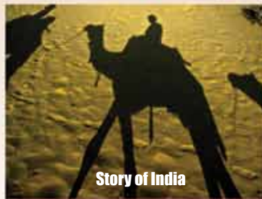
Story of India

Guerrieri Center, Atrium Gallery, SU. 410-543-6030. www.salisbury.edu/calendars