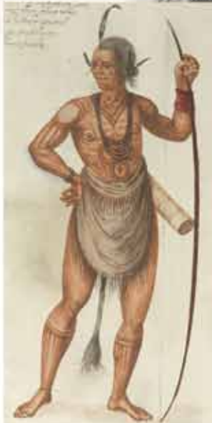
Exploration & 1st Contact

Delmarva, 1609-1732, Nabb Research Center, Salisbury. The first contact with Europeans brought profound change for Native Americans and the landscape. Maps, artifacts and documents reveal the early period of exploration by Europeans and illustrate their subsequent domination of the Eastern Shore. Free. Mon, Wed, Fri, 1pm-4pm. 410-543-6312.