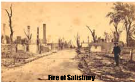
Fire of Salisbury

Fulton Hall Black Box Theatre, SU. Dark of the Moon is a dramatic stage play in the vein of Romeo and Juliet set in the Appalachian Mountains. Fri-Sat, 8pm; Sun, 2pm. 410-543-6030. www.salisbury.edu/calendars