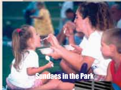
Sundaes in the Park