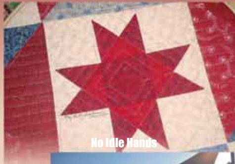
No Idle Hands