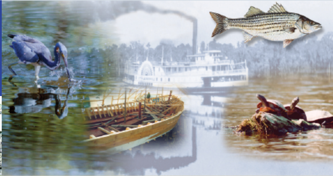
From boat-building to wildlife, these images capture some of the themes to be featured in exhibits at the new Delmarva Discovery Center in Pocomoke City.

Find out what's happening in the arts on the Shore at www.visitworcester.org or call 800.852.0335.