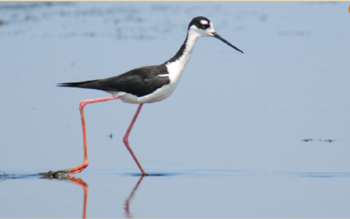
A black-necked stilt glides across the water at Assateague Island.