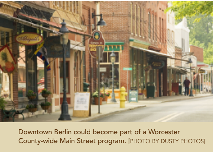
Downtown Berlin could become part of a Worcester County-wide Main Street program.

Imagine if Worcester County could be on the cutting edge of a new and exciting program that broadens the definition of Main Street Programs. Imagine too, that by establishing this program the bar of performance could be raised county wide. With planning and help from the National Main Street Center we hopefully won't have to imagine much longer.