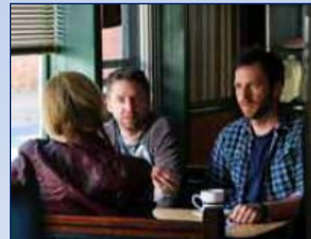
Assisted with the movie filming of Brooklyn Brothers Beat the Best